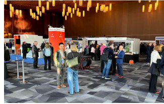
Global Food Safety Initiative Conference, Vancouver, Canada